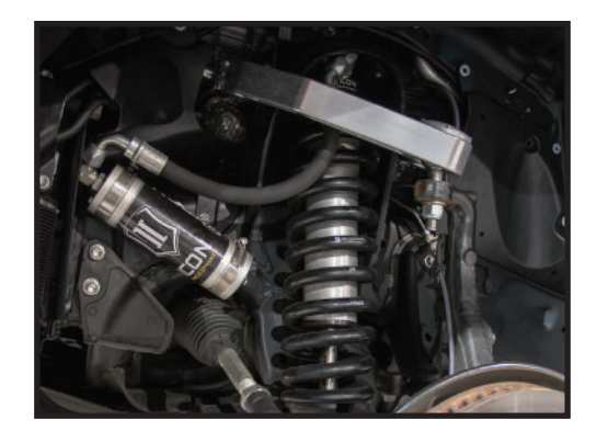
[TECH NOTE #2]